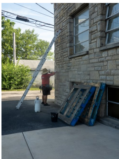
Tucking pointing being completed