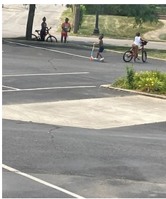
Kids on the parking lot as summer ends