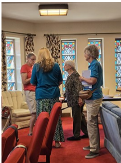
One of the Fellowship Hours at Hoge

Remember, we always need bakers to make delicious baked goods for our bake sale. You can bring them to the church on Thursday, or early Friday morning. Help us make this a wonderful event!