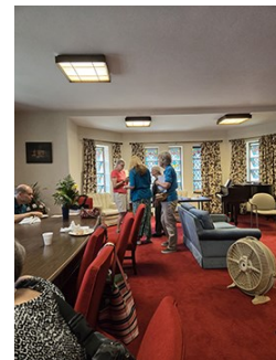
Two of the Sunday School Lessons