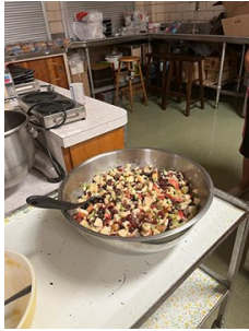
Getting ready for HM3 meal