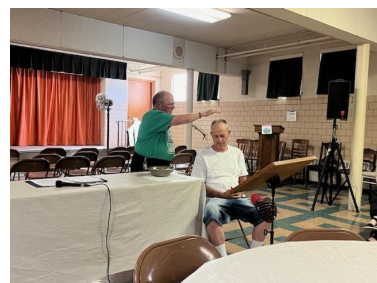
Sharing a fellowship hour